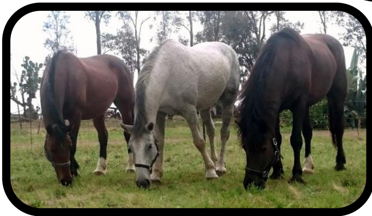
Van ons percheron sportperde