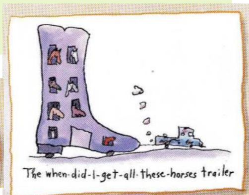
The when-did-I-get-all-these-horses trailer