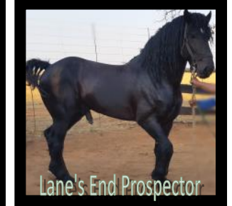
Lane's End Prospector

2 Brood mares, Vanina De St Avit and Victorie D'AJain, were imported from France, and 2 black Mares, Silvae Krissy and Lykens Valley Cayla from America together with the a black colt, Windermere's Wicker by the former world Champion Stallion Windermere's North American Maid (also known as Moose).