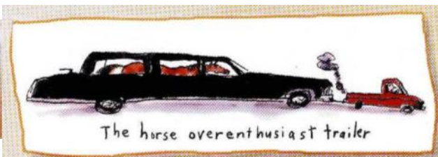
The horse overenthusiast trailer