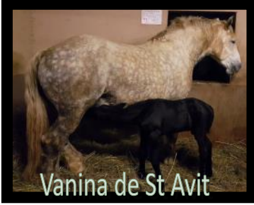
Vanina de St Avit

Sterkfontein Percheron Stud nestles at the foothills of the Waterberg north of Naboomspruit. It is a boutique stud with imported horses handpicked with certain breeding goals like size height beauty and movement in mind.